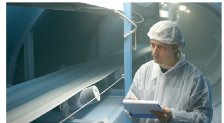
Smooth running, flexible for trough

In addition to the necessary Food Grade standards Ammeraal Beltech, thanks to R&D, develop materials and belting manufacturing methods useful to comply with the most rigid industry standards as Abrasion Resistance, Flame Retardant, Anti-Static, ATEX to work out a FIRST OF CLASS belt.