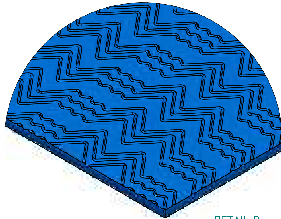
DETAIL B SCALE 5:1

REMARK: DIMENSIONS ARE TAKEN FROM BELT SAMPLE